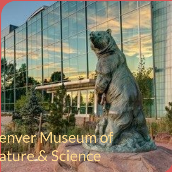
Denver Museum of Nature & Science